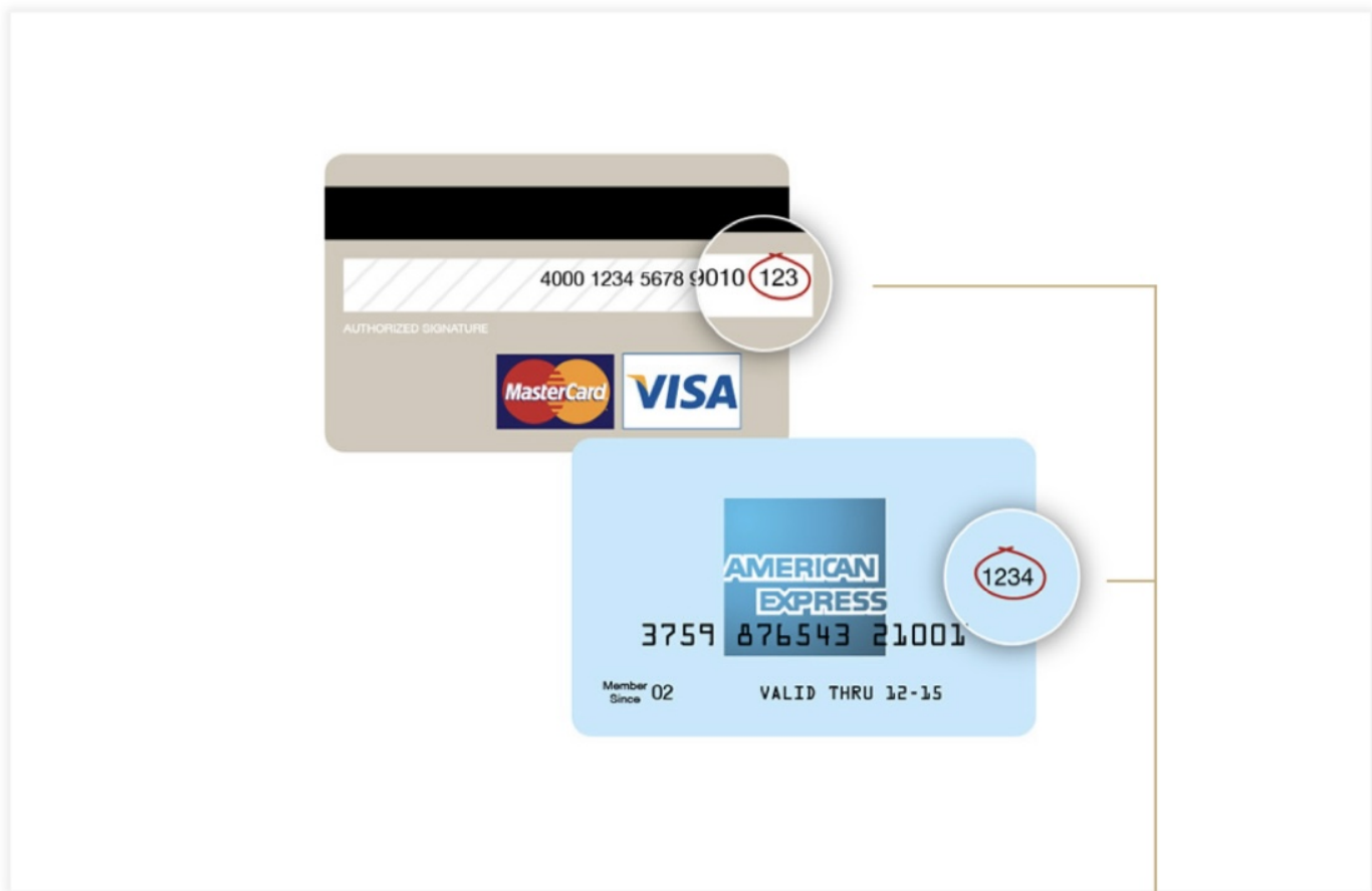
CCV location on Mastercard, Visa & American Express cards

Visa, Visa Electron, MasterCard, Maestro card, and American Express Card are accepted.